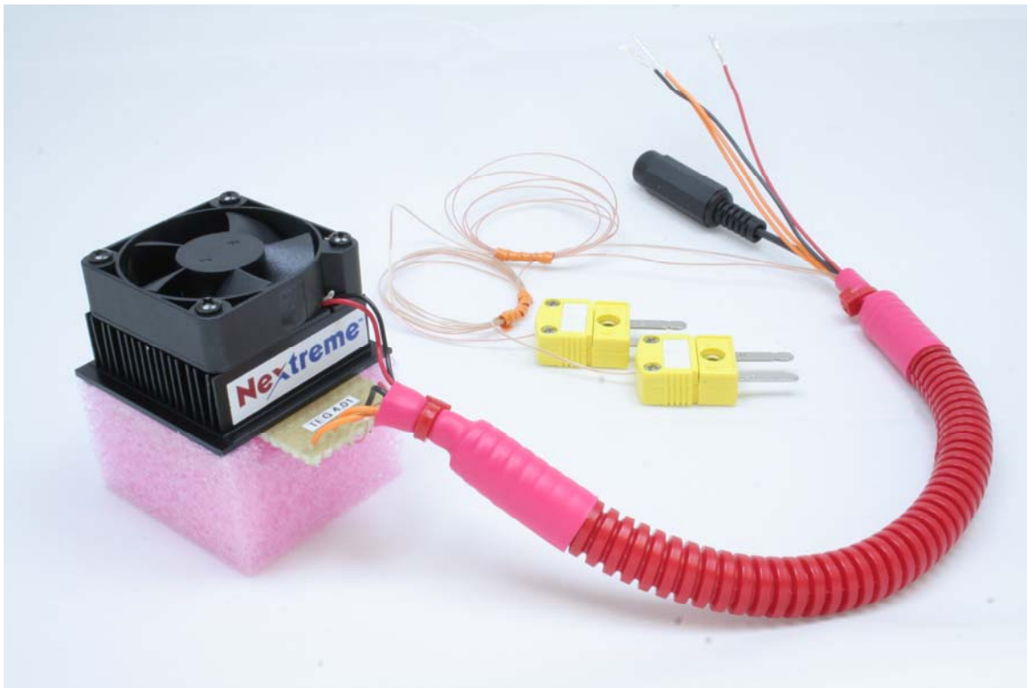
Figure 1: eTEG UPF40 Power Generator Evaluation Kit

The UPF40 eTEG evaluation kit is designed for simple, assembly-free evaluation of Nextreme's thermoelectric power generation technology. The kit provides a fully assembled unit containing a single UPF40 eTEG thermoelectric power generator, a thick film heater, a heat-sink/fan assembly and thermocouples. The kit is mounted to a pink-foam support to provide thermal insulation from the heater and to provide a stable mounting platform (Figure 1). In addition, a standard 12 VDC wall transformer is provided for powering the heat-sink fan.